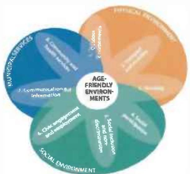
Figure 2 Eight domains of an Age-Friendly City

Source: WHO 2017 Age-friendly environments in Europe. A handbook of domains for policy action. Jackisch, J. et al (2015).